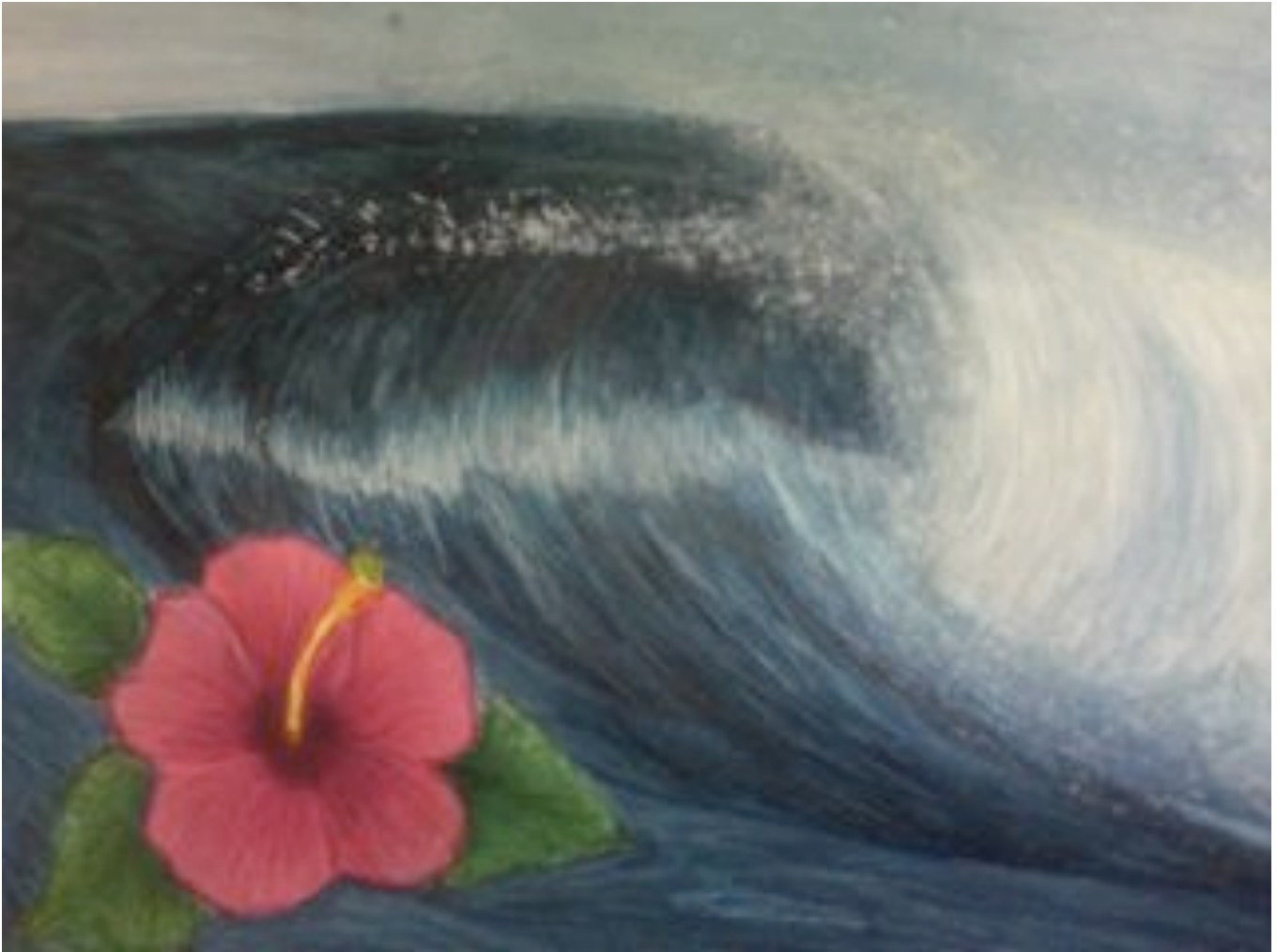
watercolor and pencil -AH.